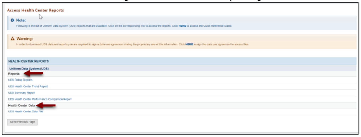
Figure 4: Access Health Center Reports Page

5. The Access Health Center Report page opens. This page lists four of the standard Reports (Figure 4). Click on the report name link to view each of the report search pages and access the reports. This page also provides a link to access the UDS Health Center Data File. The list on the page will display only UDS reports and UDS data Files.