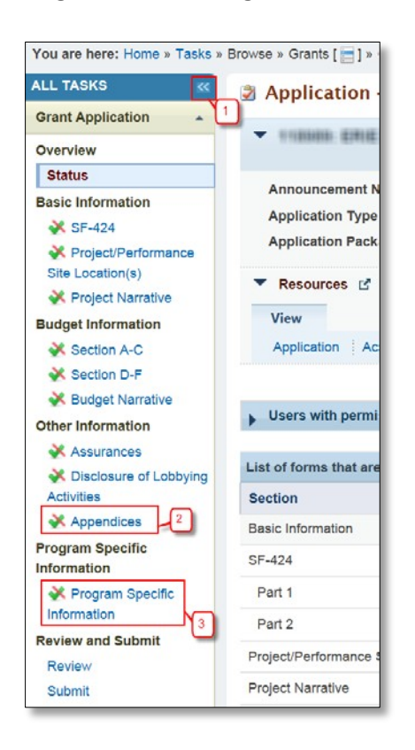
Figure 16: Left Navigation Menu