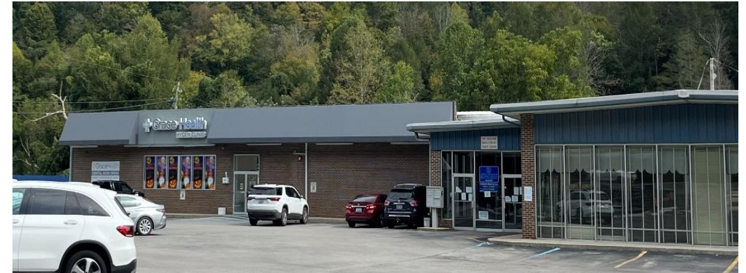
Grace Health – Hyden, KY 48 to 54 hours