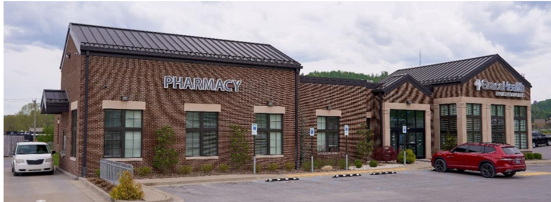
Grace Health – Manchester, KY 45 to 50 hours