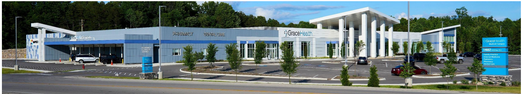
Medical Campus – Corbin, KY, 67 to 70 hours